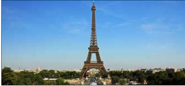
RPM Belgium applied the floors of the Eiffel Tower.