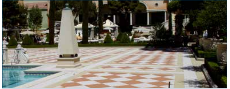
RPM Belgium applied many Pool Decks in Las Vegas.